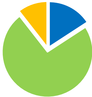
CYPS Milestone Update

■ Complete ■ In progress ■ Delayed ■ Not started ■ Not achieved